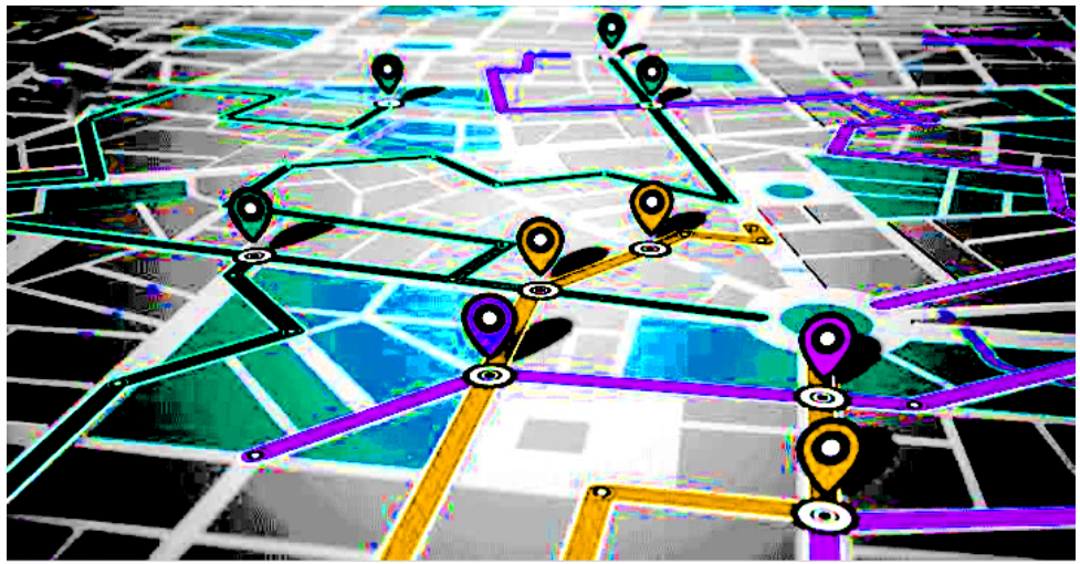
Fig 5.1 Location Tracking

The system is often employed by individual vehicle house owners furthermore as organizations to find and track their vehicles. Organizations will perpetually use it to trace the standing of their product delivery by trucks. It additionally helps house owners to stay tab on their driver, preventing vehicle abuse and so leading to vital cost-savings. The system is often simply put in in any vehicle like cars, boats and motorbikes.