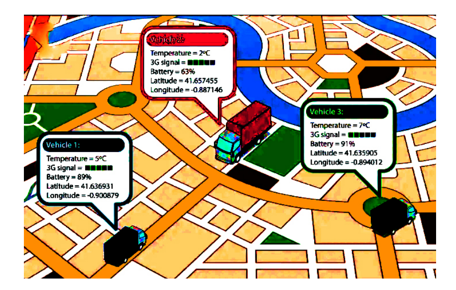
Fig 6.1 Boulders Management System

2.In future it will implementing in many projects.